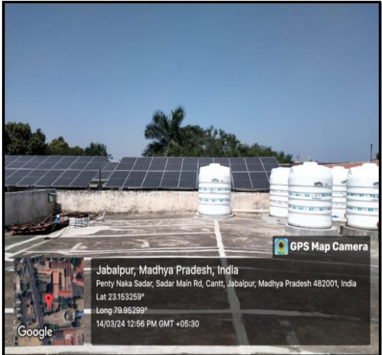
FRONT VIEW OF SOLAR PANEL

DST-FIST Supported & Star College Scheme by DBT.